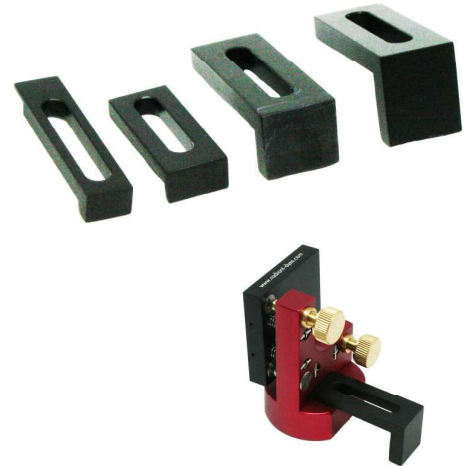
Table Clamps RD-TC

Table Clamp to fix several optomechanics on the table.